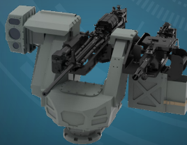
ADDER RWS TWIN