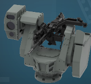
ADDER RWS LITE