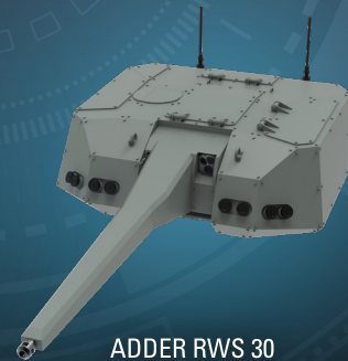
ADDER RWS 30